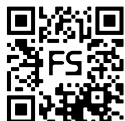
Carly's digital business card